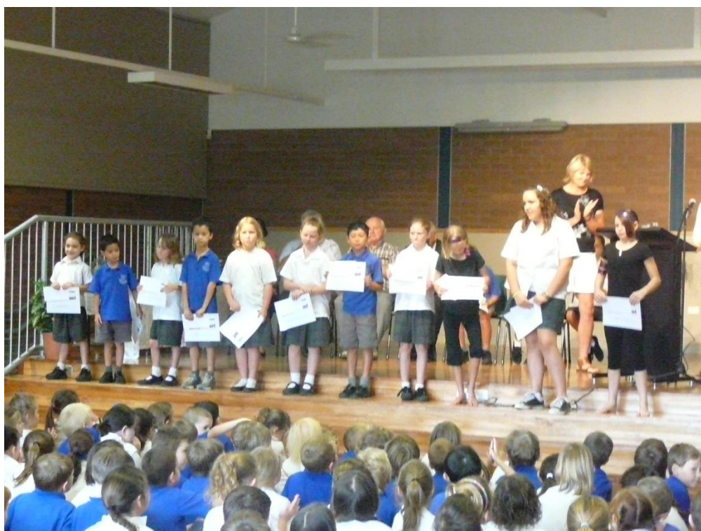
PRESENTATION DAY 2010