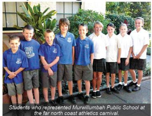
Students who represented Murwillumbah Public School at the far north coast athletics carnival.

The school will also be represented by students in many individual events including 100 metres, 200 metres, 800 metres, long jump, discus and shot putt.